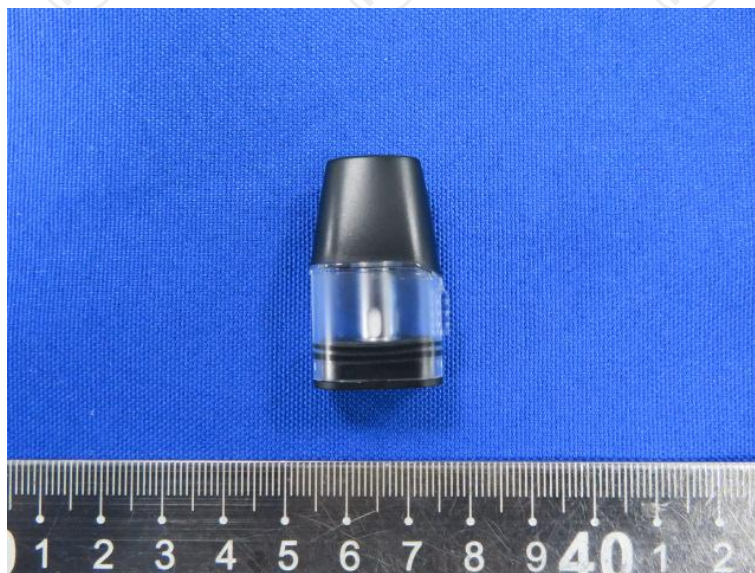
Geekvape One kit 0.8ohm FeCrAl (12-16W)